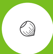
Tree Nuts (such as walnuts, brazil nuts, almonds and hazelnuts)